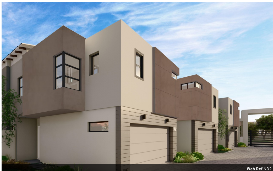
Web Ref ND2

354 Rivonia Boulevard Lillipark Office Park Suite 203, 2nd Floor Rivonia